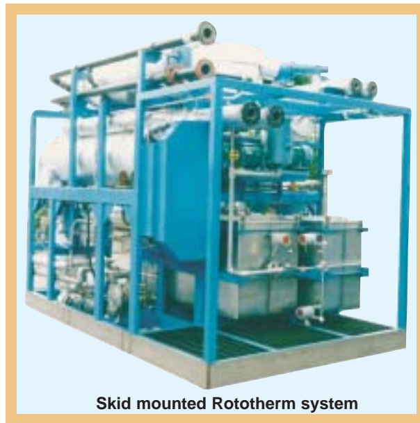
Skid mounted Rototherm system

Because each application is unique, Artisan selects the optimal design based on extensive experience and process-specific data from our pilot facility. Rototherm heat transfer areas range from 1/4 sq.ft. to 200 sq.ft. with single unit capacities