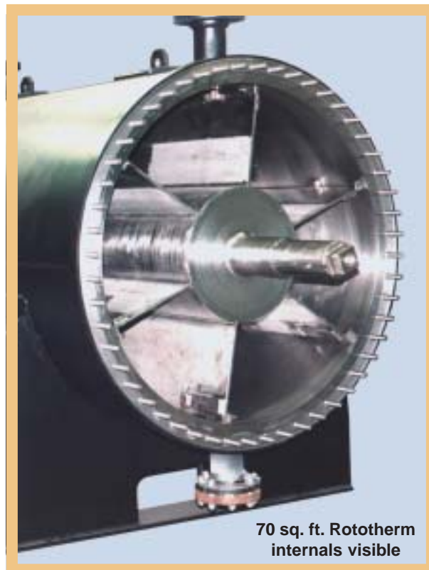
70 sq. ft. Rototherm internals visible

As a reactor, multiple feed points, multiple temperature zones, controlled residence time and simultaneous evaporation offer total flexibility for carrying out complex, continuous reactions. Even powders can be produced in a single step.